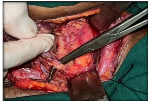
Figure 1: Showing dissection of thyroid vascular pedicle